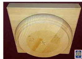
All made from solid hardwood staves

FOR CUSTOM SPECIFICATIONS & LARGER SIZES CALL