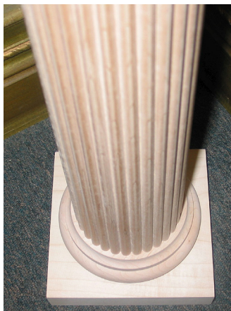
Martin Richards Design. COLLECTION